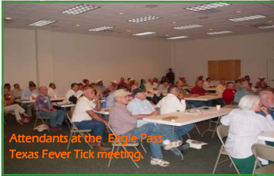
Attendants at the Eagle Pass Texas Fever Tick meeting.

transmit a tiny blood parasite called, 'babesia,' that can be deadly to cattle.